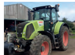
2012 Claas Axion 810, 50kph, front linkage & PTO, 3 spools, 1 years warranty, 2,300hrs £32,000 RL