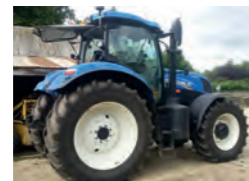
2013 New Holland T7.200 auto command, front link & PTO, 50KPH, Excellent condition £45,000 AT