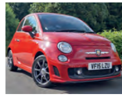
2015 Abarth 500 1.4 T-Jet, VF15 LZU, Red, 7,396 miles, £11,950. Climate control, Abarth 8-Spoke Painted Alloys, Blue & Me Hands-Free, Electric Front Windows, Hill Holder, Radio/CD/MP3 + USB.