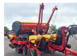
Ex-Demo Vaderstad Tempo 8 Precision Maize Drill, seed meters, seed sensors and control-station £44,000 PC