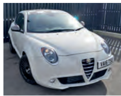
2016 Alfa Romeo MiTo 1.4 TB TwinAir Collezione, VA16 TSU, White, 100 miles, £13,950. Cloth/Faux Leather, Chequered Roof, Satnav, Cruise, DAB Radio, 5in Touchscreen, Parking Sensors.