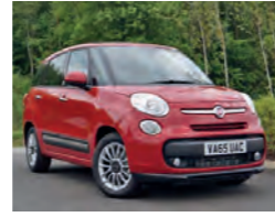
2016 Fiat 500L 1.6 MultiJet Lounge, VA65 UASC, Red, 10 miles, £14,950. Pre-Registered, 7 Seats, 5in Touchscreen, Electric Sunroof, Climate Control, Cruise, Electric Windows, Rain Sensor.