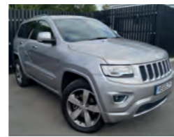
2016 Jeep Grand Cherokee 3.0 CRD Overland, VE65 ZYT, Billet Silver, 8,500 miles, £34,950. Nappa Leather Upholstery, Sunroof, Electric Mirrors, Satnav, Aircon, Cruise, Heated Seats, Alloys, Alarm.