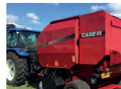
2008 Case RBX454 Rotor Feeder, variable chamber round baler, net & twine 29,000 bales £7,000 RD