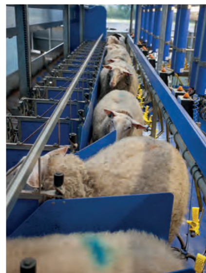
The ewes rush into the stalls - eager to be milked!

Ewes' Electronic ID tags are read on entering the parlour, and can also be automatically drafted from the rest of the flock if necessary. The tag also carries yield information enabling the highest yielders to be identified for breeding.