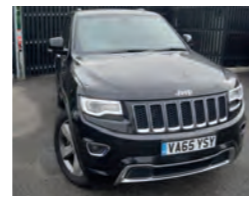
2016 Jeep Grand Cherokee 3.0 CRD Overland, VA65 YSY, Black, 7,600 miles, £34,950. Nappa Leather, Ventilated Front Seats, Panoramic Sunroof, Climate Control, Rear View Camera, Alarm.