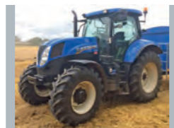
2013 New Holland T7.210, power command, 50kph, air brakes, sidewinder. Excellent Condition £45,000 AT