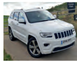
2014 Jeep Grand Cherokee 3.0 CRD Overland, OY14 YPT, White, 36,000 miles, £26,950. Leather, Deep Tint Sunscreen Glass, Heated Seats, Front/Rear Cameras, Cruise, Satnav, DAB.