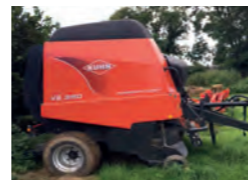
2012 Kuhn VB2160 baler, Crop cutter, drop down draw, wide pick up, excellent condition £15,000 AT