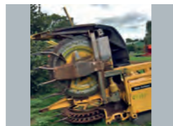
2004 New Holland 8 Row Maize Header, to fit New Holland FR. Very good condition £15,000 AT