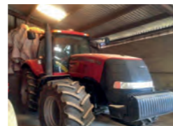
2009 Case IH Magnum, powershift, front weights, 5 electronic remotes, 600 pro screen, £45,000 SP