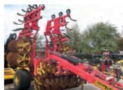
2011 VADERSTAD Rexius Twin 4.5m Press, c/w levelling boards, raptor tines, VGC £28,250 RL