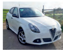
2016 Alfa Romeo Giulietta 1.4 TB MultiAir Sprint, VK16 UFJ, White, 6,000 miles, £15,450. Ex-Demo, Climate Control, 17in 5-Hole Alloys, Electric Tinted Windows, Hill Holder, TPMS, 51mpg, DAB.