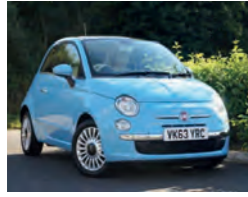
2013 Fiat 500 0.9 TwinAir Lounge, VK63 YRC, Blue, 21,948 miles, £7,2950. Satnav, Auto Climate Control, Rear Parking Aid, Fixed Glas Sunroof, 15in Alloys, Electric Front Windows, Blue & Me.