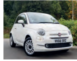
2016 Fiat 500 1.2 Eco Lounge, VK66 SRZ, Bossa Nova White, 10 miles, £10,950. Pre-Registered, Eco Engine, 66mpg, Start/Stop, Glass Sunroof, Air Conditioning, Parking Sensors, 15in Alloys.