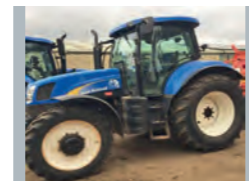
2008 New Holland T6080, excellent condition, 5000 hrs £32,000 RM