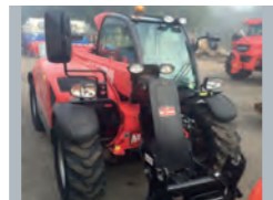
2013 Manitou MLT 627 Turbo c/w Manitou hydraulic headstock, air con, rear hitch, 1,650 hrs £31,250 PC