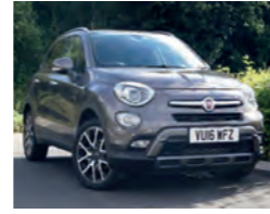
2016 Fiat 500X 1.4 MultiAir Cross Plus, VU16 WFZ, Bronze, 4,000 miles, £16,950. Ex-Demo, Satnav, Auto Climate Control, 5in Touchscreen, Dark Tinted Windows, 18in Alloys, Cruise, DAB.