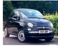
2014 Fiat 500 1.2 Lounge, VN14 OMP, Purple, 26,234 miles, £6,950. Air Conditioning, Fixed Glass sunroof, Start/Stop, Electric Front Windows, Radio/CD/MP3 with Digital Audio, 15in Alloys.