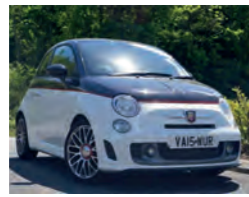
2015 Abarth 500 1.4 Turismo, VA15 WUR, Bicolour, 6,000 miles, £15,950. One Owner, Abarth Red Leather, Auto Climate Control, Diamond-Finish Alloys, Electric Front Windows, Tinted Rear Glass.