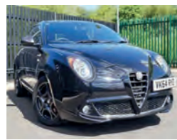
2014 Alfa Romeo MiTo 1.4 TB MultiAir Distinctive Semi-Auto, VK64 RYD, Black, 6,500 miles, £12,950. Reduced by £1,000! Cruise, Electric Windows, Front Fog Lights, Blue & Me, PDC.