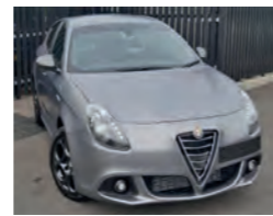
2016 Alfa Romeo Giulietta 1.4 TB MultiAir Sprint Speciale, VE16 VHY, Matt Magnesio, 50 miles, £17,950. Delivery Miles Only, 18in 5-Hole Alloys, Cloth/Alcantara, Tinted Windows, Rain Sensor.