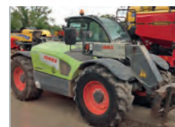
2011 Claas Scorpion 6030 CP, 4530 hours, 80% tyres £25,500 RL