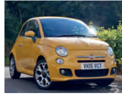
2015 Fiat 500 1.2 S VK15 VGT, Yellow, 6,989 miles, £8,450. One Owner, Auto Climate Control, Rear Parking Sensors, Start/Stop, 16in Alloys, Electric Front Windows, Tinted Rear Windows, Hill Holder.