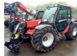
2013 Manitou MLA629 c/w new tyres £29,000 BW