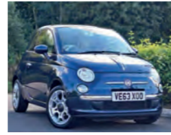
2014 Fiat 500 1.2 Lounge, VE63 XOO, Blue, 16,216 miles, £6,950. Air Conditioning, Start/Stop, Fixed Glass Roof, 15in Multispoke Alloys, Electric Front Windows, Radio/CD/MP3 with Digital Audio.