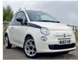
2013 Fiat 500 1.2 Pop, WU63 YHF, White, 26,000 miles, £6,250. Stop/Start, Electric Front Windows, Radio/CD/MP3, Special Alloy Wheels, Chequered Flag Decals, 55mpg, One Owner.