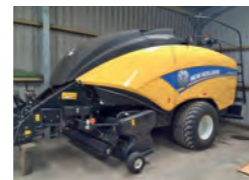
2013 New Holland BB870 Crop cutter, like new £40,000 AT