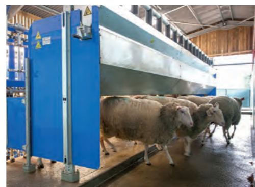
The stalls in the milking parlour are raised to allow the ewes to exit.

"The preparations and installation of the new parlour were going to take several months, but in the meantime we had an urgent need to improve our milking facilities. T H WHITE built us a temporary portable parlour, mounted on a lorry trailer so that we could move it around easily - a great interim solution that cut milking time to 2½ hours, still a lengthy process but a lot better than before!"