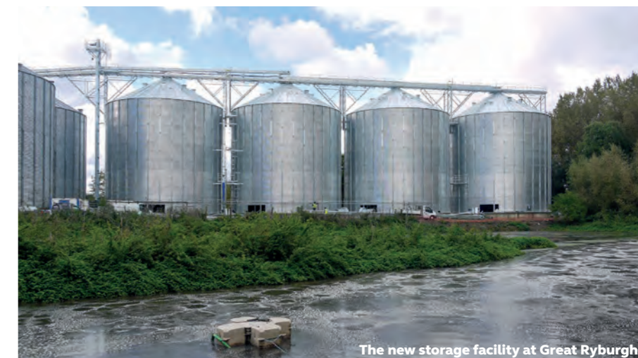
The new storage facility at Great Ryburgh

For more information on specialist milking parlours please contact T H WHITE Dairy on 01373 465941.