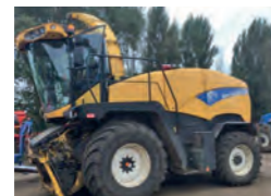
2010 New Holland FR9060, 4wd, grass & maize £78,500 AT