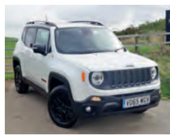
2015 Jeep Renegade 2.0 MultiJet II Trailhawk, VO65 WGV, White, 6,791 miles, £23,850. Function Pack, 8-Way Seats, Rear Camera, Visibility Pack, Electric Panoramic Sunroof, Gloss Black Alloys, Satnav.