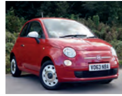
2013 Fiat 500 1.2 Colour Therapy, Vo63 NBA, Red, 7,500 miles, £6,950. Air Conditioning, Electric Front Windows, Radio/CD/MP3, hite and Chrome Wheels, One Owner, 59mpg.