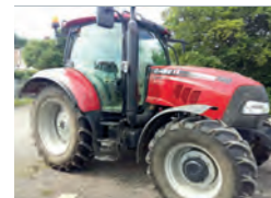
2011 Case IH Maxxum 140 4wd, 3675 hrs, air seat A, air con, 40kph, hyd push back hitch £28,500 SC