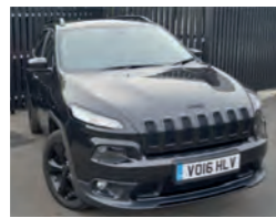
2016 Jeep Cherokee 2.2 MultiJet II Night Eagle Automatic, VO16 HLV, Black, 5,000 miles, £28,750. Morocco Black Nappa Leather, 8.4in Touchscreen, Cruise, DAB, Climate Control, Heated Seats.