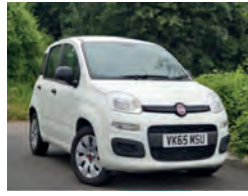
2015 Fiat Panda 1.2 Pop, CF15 NBX, White, 5,000 miles, £5,450. Stop/Start, Electric Front Windows, Hill Holder, Radio/CD/MP3, Tyre Pressure Monitoring System, 55mpg, One Owner.