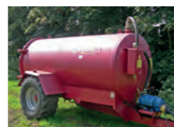
2014 Marshall 1800 gallon tanker, 550x22.5 tyres, fully opening back door, mudguards £5,650 BG

Sales Hotline: 01373 465941 (Mon-Fri 08.00-17.00) Out of hours: 07710 985957