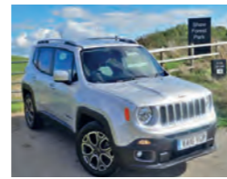
2016 Jeep Renegade 1.6 MultiJet II Limited, VA16 VGP, Glacier, 4,500 miles, £20,995. Ex-Demo, 8-Way Power Front Seats, Rear Camera, Two-Tone Alloys, Cruise, Climate Control, Privacy Glass.