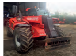
2009 Manitou 735T, Aircon, Pick up hitch & tipping pipe, smooth ride, comfort seat, 4,400hrs £25,500 RD