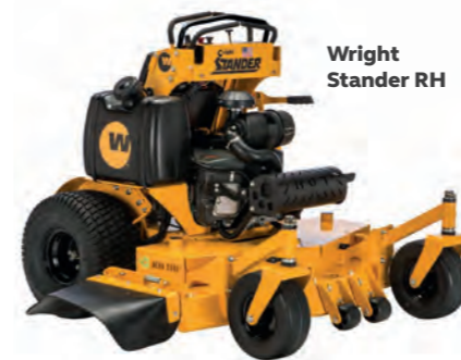
Wright Stander RH

Saltex 2016 is a big occasion for Ferris & Wright Mowers, distributed in the UK by T H WHITE Machinery Imports.