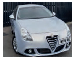
2015 Alfa Romeo Giulietta 2.0 JTDM-2 Business Edition, WV15 WSZ, Lunar Pearl, 14,000 miles, £14,950. 16in Turbine Alloys, Hill Holder, Voice Recognition, DAB Audio, Bluetooth, Start/Stop.