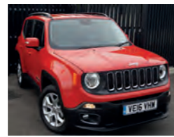
2016 Jeep Renegade 1.4 MultiAir Longitude, VE16 VHW, Red Pastel, 500 miles, £17,450. Satnav, Air Conditioning, Alarm, Cruise, DAB, 17in Alloys, Hill Start Assist, Rear Parking Sensors.