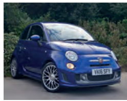
2016 Abarth 500 1.4 T-Jet 595 Turismo, VK16 SFY, Blue, 5,200 miles, £15,450. Ex-Demo, Auto Climate Control, Abarth Leather Upholstery, 17in Diamond-Finish Alloys, Electric Front Windows.