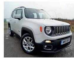
2015 Jeep Renegade 1.4 MultiAir II Longitude, WM15 RFZ, White, 7,353 miles, £13,950. Pastel Paint, Satnav, Cruise, Power Windows, Air Conditioning, Start/Stop, Rear Parking Sensors, TPMS.