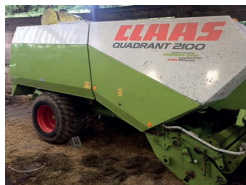
2006 Claas Quadrant 2100 Baler, 55,000 bales, good condition £POA BW