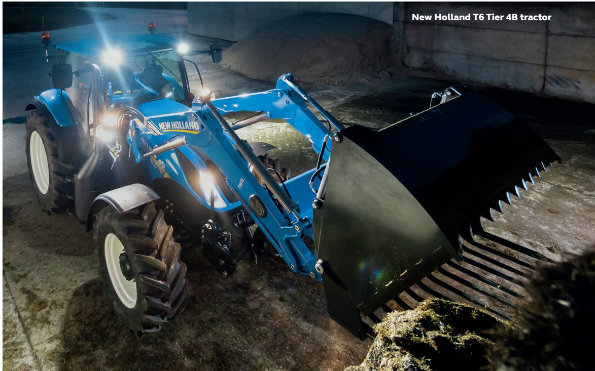
New Holland T6 Tier 4B tractor