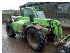
2012 Merlo 32.6 Plus, c/w pin & cone headstock £POA BW