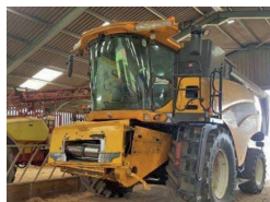
2010 CR9060L Combine, 24' header, 1273 engine hrs, 896 threshing hrs, chopper, chaf spreader £91,000 RM