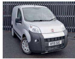
2015 Fiat Fiorino 1.3JTD Cargo SX Panel Van, VF15 SOC, Metallic Silver, 21 miles only, £9,950. Air Conditioning, Electric Windows, Electric Mirrors, Multi-Function Steering Wheel, Parking Sensors.