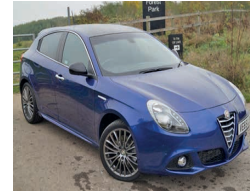
2015 Alfa Romeo Giulietta 2.0 JTDM-2 Collezione, VE65 LJY, Metallic Blue, 3,000 miles, £18,450. Leather/Microfibre, Cruise, Auto Climate Control, Heated Front Seats, Rain Sensor.