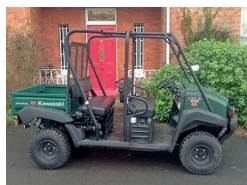
2013 Kawasaki 4010 Mule Trans, 4 x 4 Diesel, VGC, road legal, 680 hrs, towball £6,250 SK