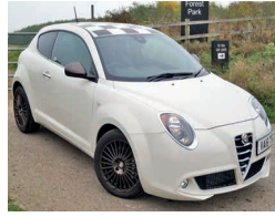
2016 Alfa Romeo MiTo 1.4 TB TwinAir Collezione, VA16 TSU, White, 100 miles, £13,450. Collezione Cloth/Faux Leather, Chequered Roof, Satnav, Climate Control, One-Touch Dark Windows.