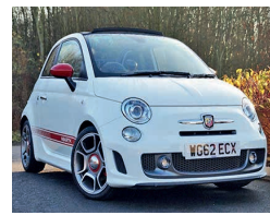
2012 Abarth 595C 1.4 T-Jet Turismo, WG62 ECX, White, 16,200 miles, £11,950. Abarth Leather, Auto Climate Control, 17in 10-Spoke Alloys, Tinted Glass, Electric Windows, PDC.