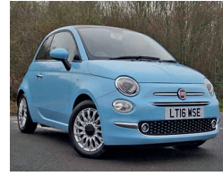
2016 Fiat 500 1.2 Lounge Dualogic Automatic, LT16 WSE, Blue, 4,000 miles, £10,950. Memory Front Seats, Hill Holder, Rear parking Sensors, Start/Stop, Air Conditioning, Glass Roof.