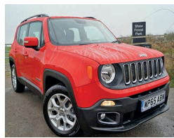
2015 Jeep Renegade 1.6 E-Torq Longitude, WP65 ABN, Red, 3,632 miles, £13,450. Start/Stop, Satnav, 5in Touchscreen, Cruise, 17in Alloys, Power Windows, Hill Start Assist, Aircon, DAB Audio.