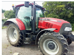
2011 Case IH Maxxum 140 4wd, 3675 hrs, air seat A, air con, 40kph, hyd push back hitch £28,500 SC