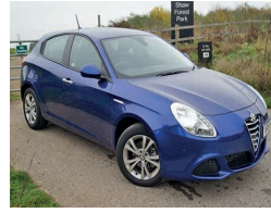
2015 Alfa Romeo Giulietta 1.6 JTDM-2 Progression, VF15 VEA, Blue, 4,000 miles, £11,950. Start/Stop, DAB Audio, Climate Control, Bluetooth Hands-Free, Electric Windows, Hill Holder.