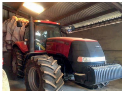
2009 Case IH Magnum, powershift, front weights, 5 electronic remotes, 600 pro screen, £45,000 SP