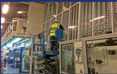
Safe access at spray can plant