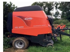
2012 Kuhn VB2160 baler, Crop cutter, drop down draw, wide pick up, excellent condition £15,000 AT