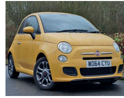
2015 Fiat 500 1.2 S, WO64 CYU, Yellow, 15,500 miles, £7,950. Start/Stop, Automatic Climate Control, Rear Parking Sensors, 16in Alloys, Tinted Glass, Electric Front Windows, Hill Holder.