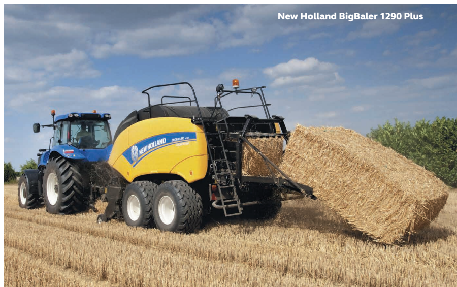
New Holland BigBaler 1290 Plus