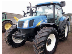
2008 New Holland T6030 plus, 40k, 16/16 Electro Shift, 4,900 hrs, cab suspension £24,000 CD