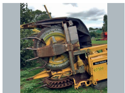
2004 New Holland 8 Row Maize Header, to fit New Holland FR. Very good condition £15,000 AT