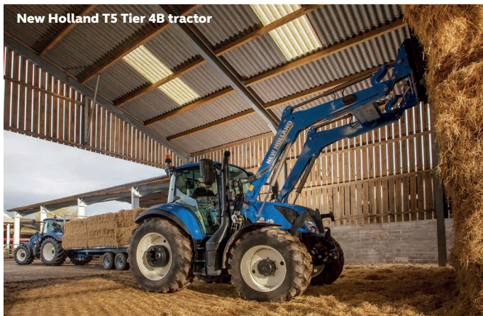
New Holland T5 Tier 4B tractor

News and information from the T H WHITE Group