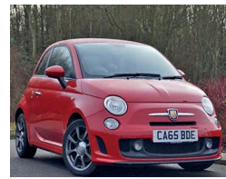
2015 Abarth 595 1.4 T-Jet, CA65 BDE, Red, 13,750 miles, £10,950. 16in 8-Spoke Anthracite Alloy Wheels 16in 8-Spoke Anthracite Alloy Wheels, Air Conditioning, Electric Windows, Tinted Glass.