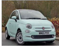
2015 Fiat 500 1.2 Lounge, WM65 PKV, Green, 14,750 miles, £8,950. Start/Stop, Air Conditioning, Fixed Glass Roof with Sunblind, Memory Front Seats, Hill Holder, 15in Alloy Wheels, One Owner.