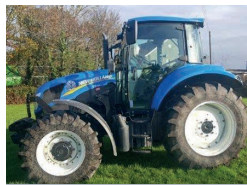
2014 New Holland T5.105, 4wd, loader ready, powershuttle, passenger seat, 350 hrs £35,000 RM