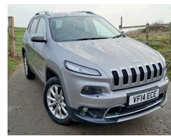
2014 Jeep Cherokee 2.0 CRD Limited, VF14 ECE, Billet Silver, 22,449 miles, £17,450. Morocco Nappa Leather, Heated Front Seats, Auto Aircon, Satnav, Parksense, Rear Camera, Voice Command.