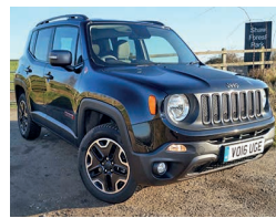
2016 Jeep Renegade 2.0 MultiJet II Trailhawk, VO16 UGE, Black, 7,101 miles, £21,450. Morocco Power Seats, Leather, Aircon, DAB, Tinted Glass, Hill Start Assist, 17in Alloys, Satnav, Cruise, DAB, Alarm.