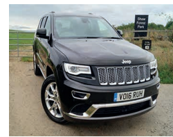
2016 Jeep Grand Cherokee 3.0 CRD Summit, VO16 RUH, Black, 7,008 miles, £38,950. Natura Plus Leather, Ventilated Heated Seats, Rear DVD/Blu-Ray, Panoramic Sunroof, Parkview Rear Camera.