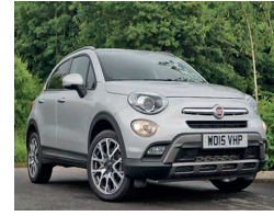
2015 Fiat 500X 1.4 MultiAir Cross Plus, WO15 VHP, Grey, 9,074 miles, £11,950. Dual Zone Climate Control, Cruise, Satnav, EcoLeather/Fabric, Tinted Glass, Electric Windows, Parking Sensors.