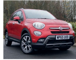
2016 Fiat 500L 1.3 MultiJet Pop Star Dualogic, VK16 FNR, Red, 500 miles, £11,950. Ex-Demo, Start/Stop, Cruise, Radio/CD/MP3, Air Conditioning, Hill Holder, 5in Touchscreen, TPMS.