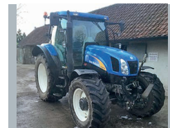
2009 New Holland T6070, c/w full suspension, front lkg, 17 x 16 gearbox, 50kph, 5,000 hrs £27,000 JW