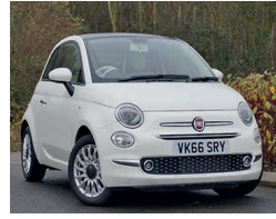
2016 Fiat 500 1.2 Eco Lounge, VK66 SRY, Bossa Nova White, 10 miles only, £9,950. Delivery Miles, Air Conditioning, Rear Parking Sensors, Electric Front Windows, Glass Roof, Start/Stop, Radio + USB