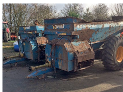
West Dual Spreaders, average condition £POA BW