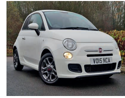
2015 Fiat 500 0.9 TwinAir S, VO15 NCA, White, 9,800 miles, £8,850. Start/Stop, Automatic Climate Control, Rear Parking Sensors, 16in Alloys, Tinted Glass, Electric Front Windows, Hill Holder, TPMS.