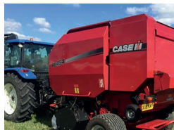
2008 Case RBX454 Rotor Feeder, variable chamber round baler, net & twine 29,000 bales £7,000 RD