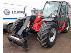
2011 Manitou MLT634T, 120 LSU PS, pin & cone carriage, will be fitted with new tyres, good condition £26,500 AD