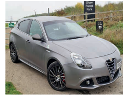
2016 Alfa Romeo Giulietta 1.7 TBI Quadrifoglio Verde TCT, VE16 RRU, Matt Magnesium, 3,000 miles, £21,950. 18in Turbine Alloys, Auto Climate Control, DAB Audio, Cruise, Parking Sensor.