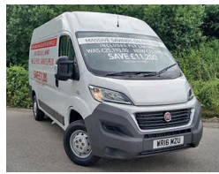
2016 Fiat Ducato 2.3JTD MultiJet II 35 MH2, WR16 MZU, White, 10 miles only, £12,950. Massive £11,200 saving on Pre-Reg! Choice of Four, Electric Windows, Hill Holder, Radio/MP3/Aux.