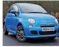
2015 Fiat 500 1.2 S, VO64 CXV, Blue, 16,000 miles, £7,950. Start/Stop, Automatic Climate Control, Rear Parking Sensors, 16in Alloys, Tinted Glass, Electric Front Windows, Hill Holder, TPMS.