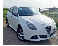
2016 Alfa Romeo Giulietta 1.4 TB MultiAir Sprint, VKE16 UFJ, White, 6,000 miles, £13,950. Huge Saving on list! Climate Control, Start/Stop, Tinted Glass, Bluetooth Hands-Free, TPMS.