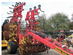
2011 VADERSTAD Rexius Twin 4.5m Press, c/w levelling boards, raptor tines, VGC £23,000 RL