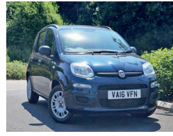
2016 Fiat Panda 1.2 Easy, VA16 VFN, Blue, 10 miles only, £7,950. Pre-Registered, Start/Stop, Air Conditioning, Electric Front Windows, Hill Holder, Radio/CD/MP3, Head Restraints, TPMS.