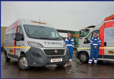
On-the-spot commercial vehicle repairs