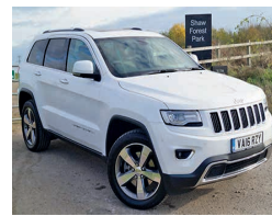
2016 Jeep Grand Cherokee 3.0 CRD Limited Plus, VA16 RZY, White, 2,850 miles, £33,950. Panoramic Sunroof, Sunscreen Glass, Heated Seats, Rain Sensor, Climate Control, Premium Leather.