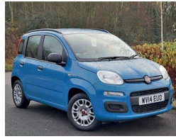
2014 Fiat Panda 1.2 Easy, WV14 EUO, Turquoise, 28,250 miles, £4,750. Reduced - save £700! Radio/CD/MP3, Air Conditioning, Pollen Filter, Electric Front Windows, 54mpg, Two Owners.