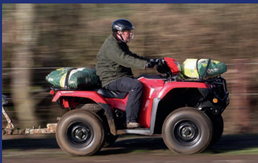
Honda Foreman raises the game